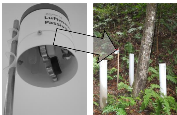
Protective shelter for ammonia and forest measuring site

The main source of ammonia is the decay of organic matter containing nitrogen, especially animals' excrements. In Germany, the most important source of \text{NH}_3 is livestock farming. Actually, a large quantity of \text{NH}_3 is released by producing, storing, transporting/handling, and using animals' excrements (black liquid, manure). Other sources of emissions do include the use of agricultural fertilizer containing Nitrogen and, in a smaller proportion, the production industry. There is currently no precise measure of \text{NH}_3 emissions in Germany. Estimated and extrapolated values are 0.6 - 1.1 \cdot 10^3 \text{ kt NH}_3