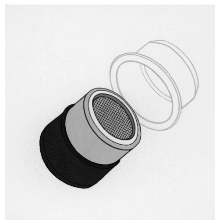
Schematic view of \text{NH}_3 sampler

The ammonia diffusive sampler is based on the principle of ammonia molecules diffusion of on an absorbent medium, in this case phosphoric acid. The diffusive sampler consists in a polypropylene housing which has a 20mm diameter opening. A Teflon membrane supported by a wire net is used in order to reduce wind effects. A special suspension device is also recommended to protect the sampler from wind and stress of weather.